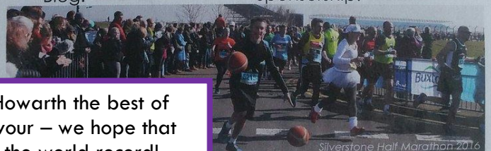
Silverstone Half Marathon 2016