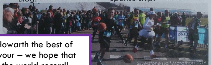
Silverstone Half Marathon 2016