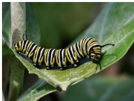
Easter Caterpillar - crawling along the floor