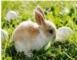
Easter Bunny - hop