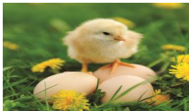
Easter chick - wing flapping