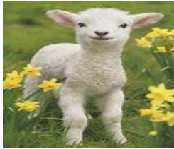
Easter Lamb - Running on the spot