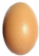
An egg - rolling around