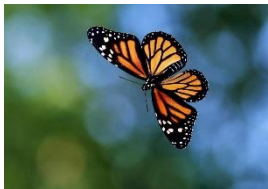
Easter Butterfly – fluttering/flying